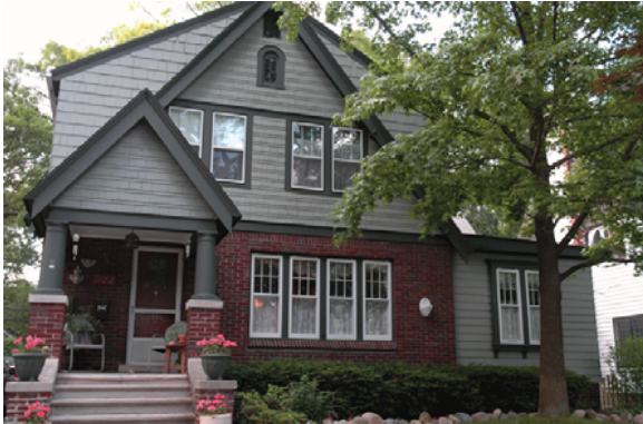
322 W. Maplehurst