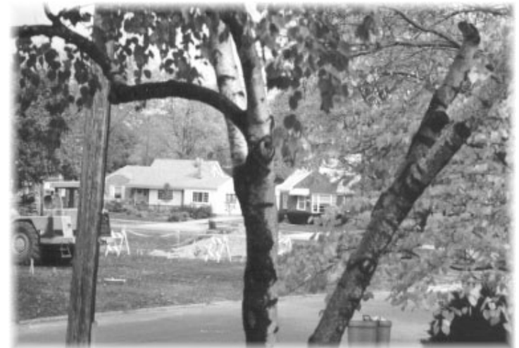
This picture, facing Pinecrest and taken in the fall of 1998, shows where construction had begun on a parking lot in the SE corner of Geary Park.